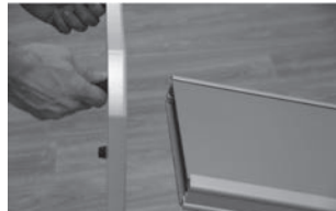
Line up the base plate holes to the main body part