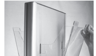
Insert the brochure holders on the rectangular panel