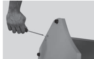
Fix the base plate to the rectangular panel using screws provided