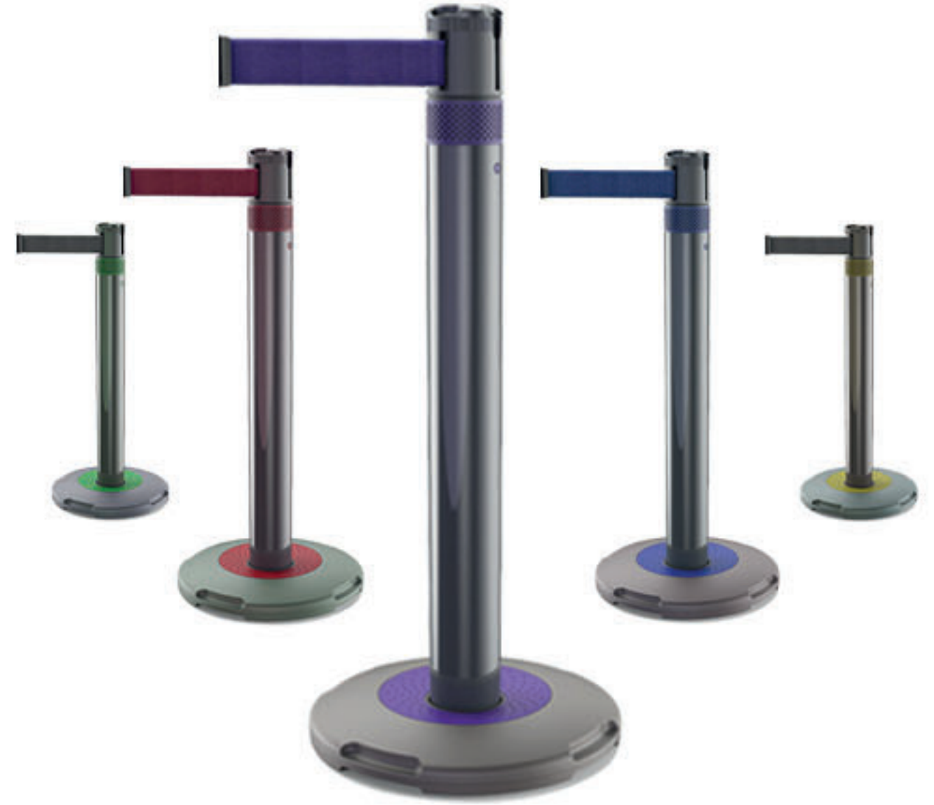
Includes 3 metres of coloured webbing.

The Q system has so many modular options available it can be tailored to create colour combinations that really brings the barrier system to life.