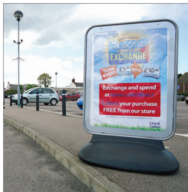
Sentinel® working hard for major retailers across the country