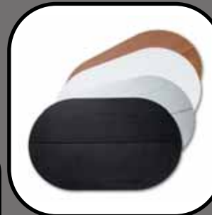
Choice of Table Tops