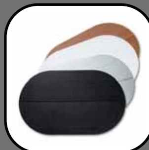
Choice of Table Tops